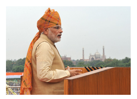
Prime Minister addresses the Nation